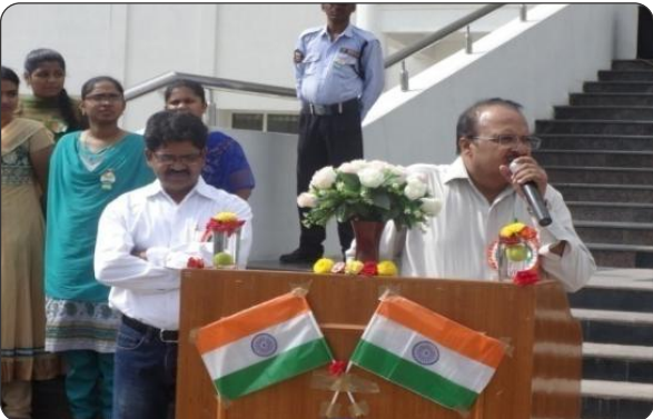
Students and HoD of H&S Dept. Listening Principal's speech