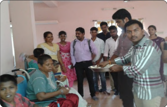
MBA Students distributing fruits at Abhaya Kshethram

The Department of Management Studies has organised "Helping Hands" Programme on 26th August 2016 to help the poor and needy and to inculcate philanthropic attitude in students. Faculty members & Students visited ABHAYA KSHETHRAM near Renigunta on the occasion of 'Mother Teresas 106 th ' birth anniversary.