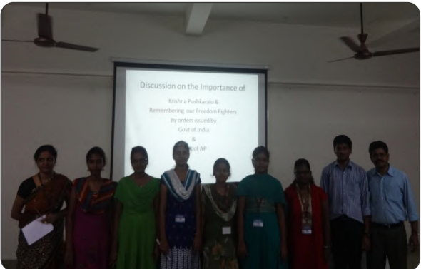
69 th INDEPENDENCE DAY

As per the instructions issued by the Hon'ble CM of Andhra Pradesh, Sri Nara Chandra Babu Naidu garu to celebrate the auspicious occasion of Krishna Pushkaralu, various competitions like essay writing, elocution, dance, painting, etc., were held on 13 th August 2016 and toppers were appreciated.