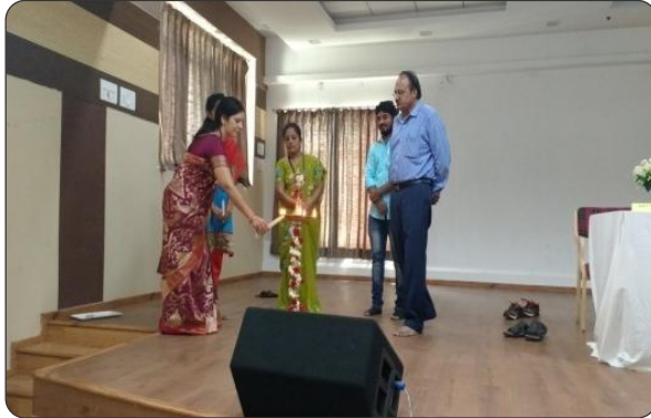
Robotic workshop inauguration