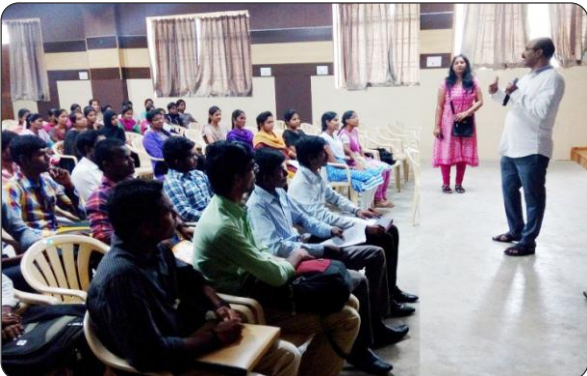
LLK Software Solutions Officials giving instructions to the candidates