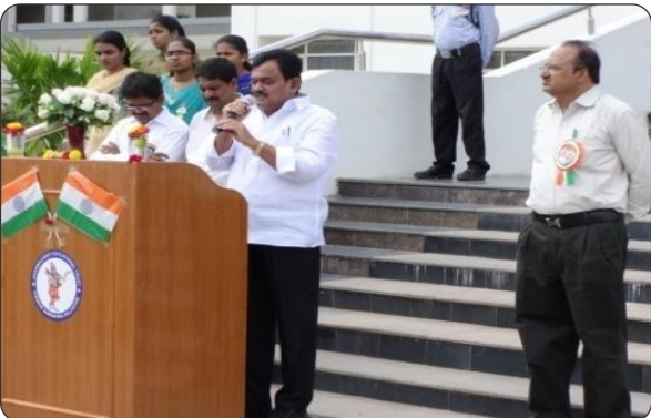
Vice-Chairman of the college addressing the students