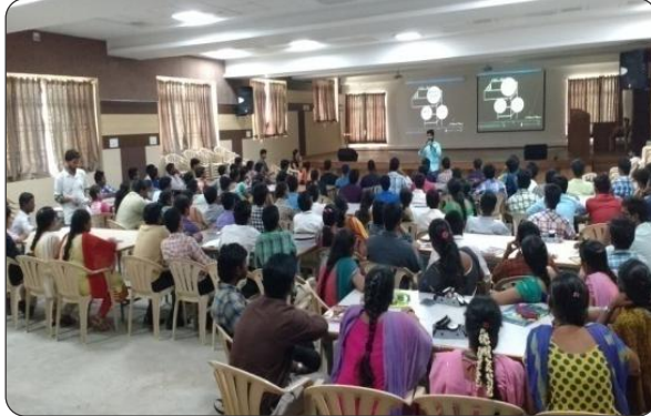
II Club officers delivering the speech