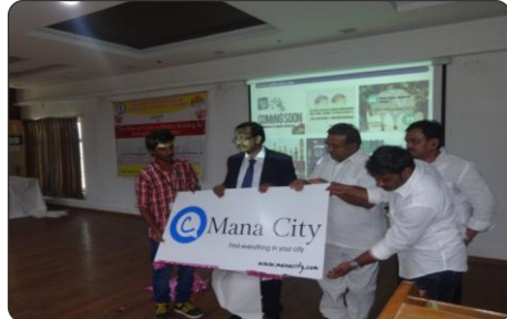
Launching of Mana City App by the dignitaries